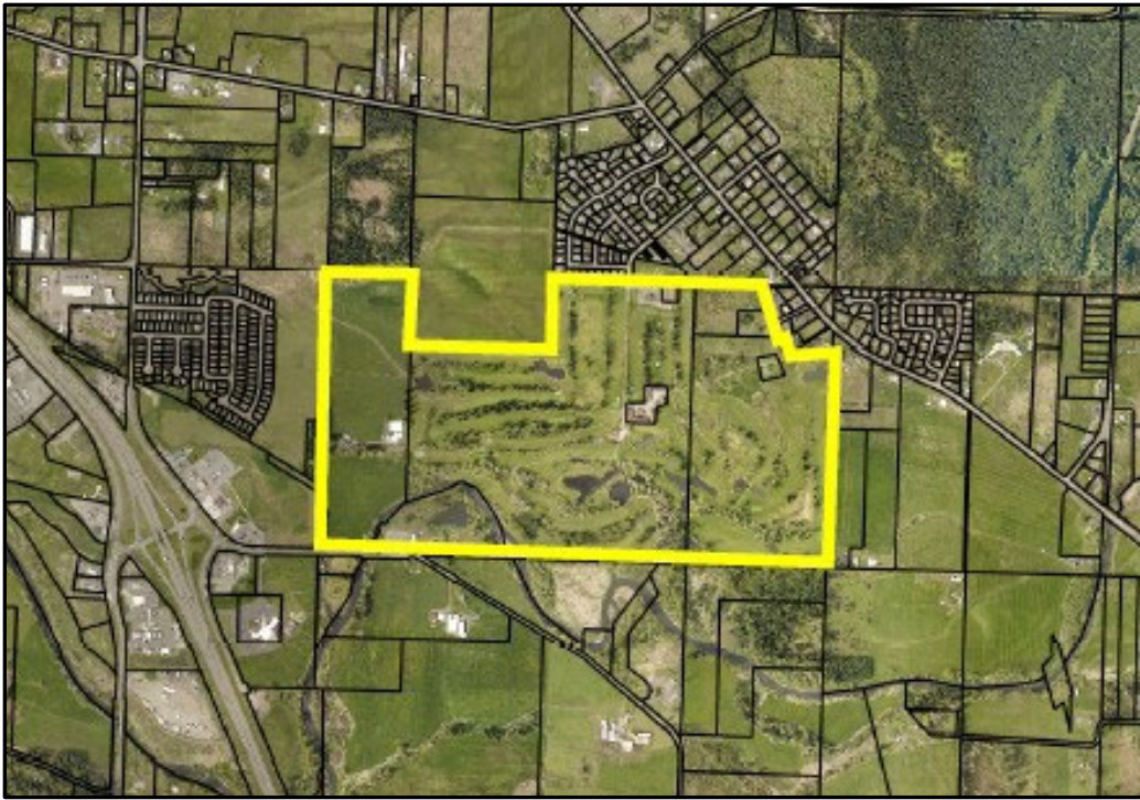
Map 1: Chehalis Westlund-Enbody UGA Expansion Area